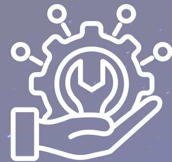
Tech Solution Providers

Recognizes outstanding AI application projects jointly developed by tech companies and clients, celebrating impactful collaborations that showcase either a single transformative project or a broader AI strategy that drives innovation and growth. Nominations can be for a single project or an overall strategy. Winner should demonstrate how AI+ solutions has brought cost benefits, improved internal processes and created new opportunities.